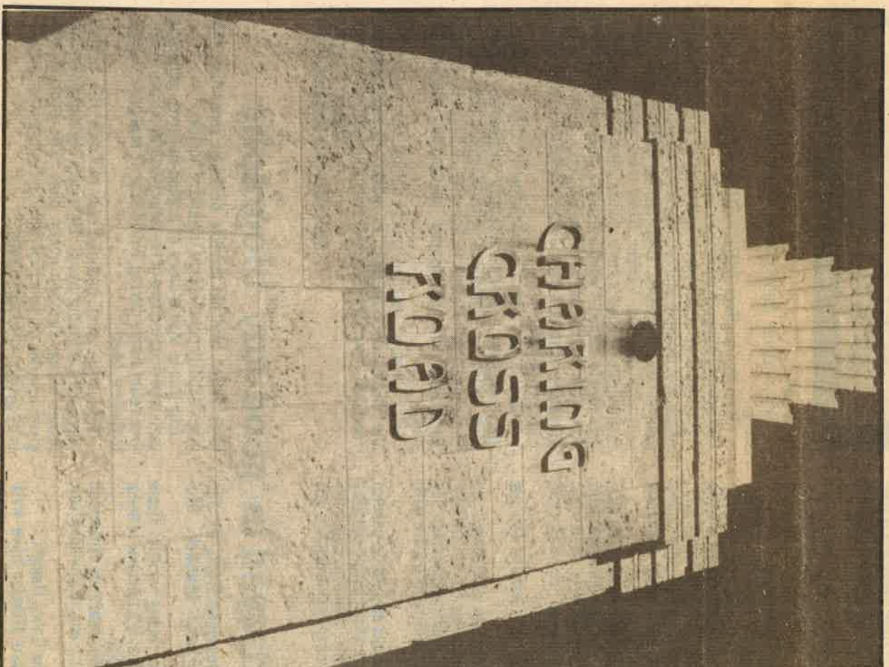
Charing Cross columns reveal a striking, yet dignified Art Deco architecture

time between 1925-30. He says there are also lights built into the columns, but the electrical conduits have rusted, making the lighting unsafe. Wouldn't it be wonderful to see them lit now?