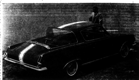
NEW FASTBACK, PLYMOUTH BARRACUDA Retains sporty appearance and utility of predecessor.

Improvements to the electrical and ignition systems include new distributor caps made of a new glass-filled material which have more resistance to insulator "tracking" than the previously-used caps.