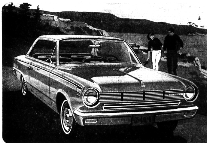
'65 RAMBLER AMERICAN The Compact Economy King

versions of the brilliant Torque Command high-performance engine—the 6 that comes on like an 8. Two V-8 options, up to 270 hp. NEW! Disc Brakes optional. Double-Safety Brakes, separate systems front and rear, standard on all Ramblers.