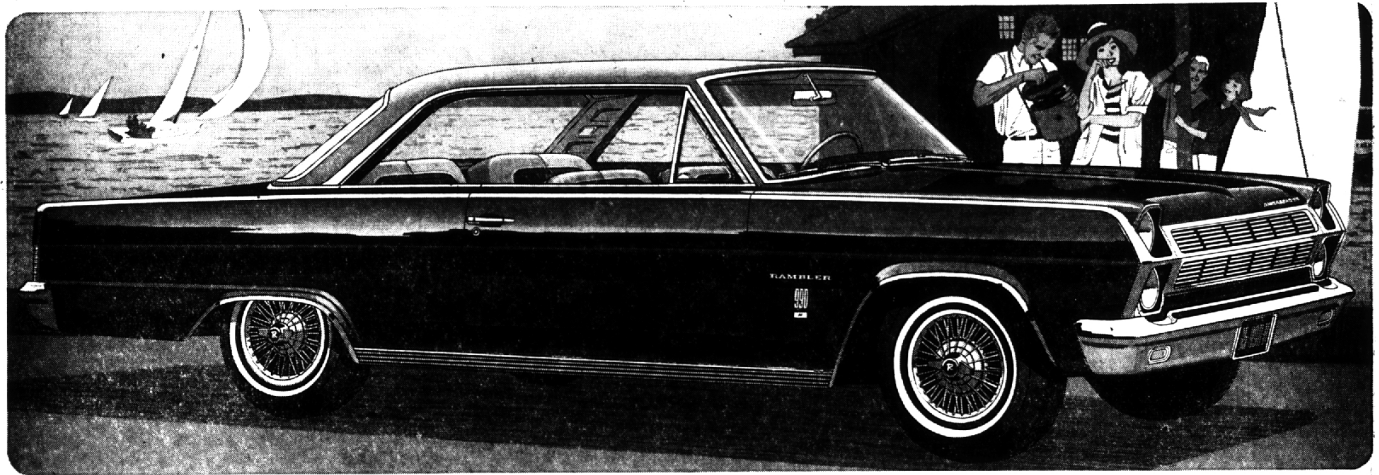
'65 RAMBLER AMBASSADOR Largest and Finest of the New Ramblers

New! 3 Different Sizes. New! 3 Different Wheelbases. New! 7 Spectacular Engines.