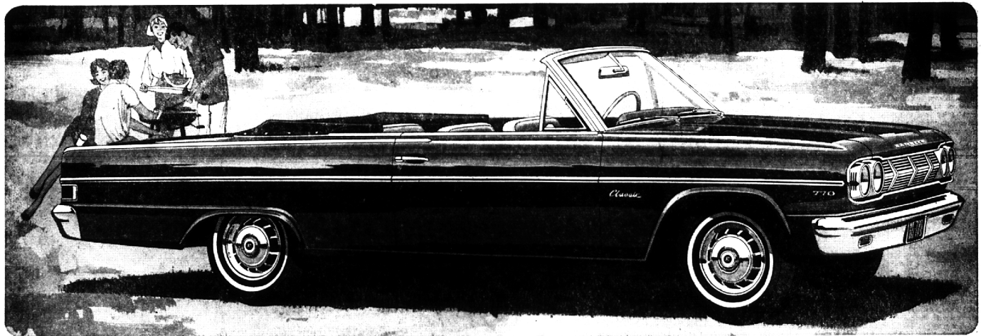
'65 RAMBLER CLASSIC New Intermediate-Size Rambler

for greatest stopping power. NEW! Spectacular choice of engines from the all-new 155-hp Torque Command 232 Six to optional 327 cu.-in. V-8. NEW! Twice as many models—hardtops, sedans, wagons and a dazzling new convertible.