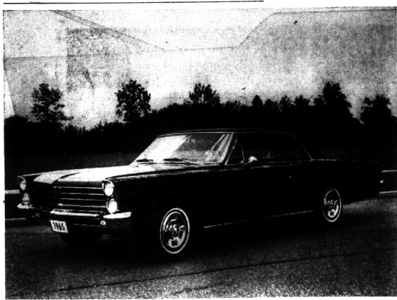
PONTIAC'S TEMPEST CUSTOM 12 new models are offered in 1965.