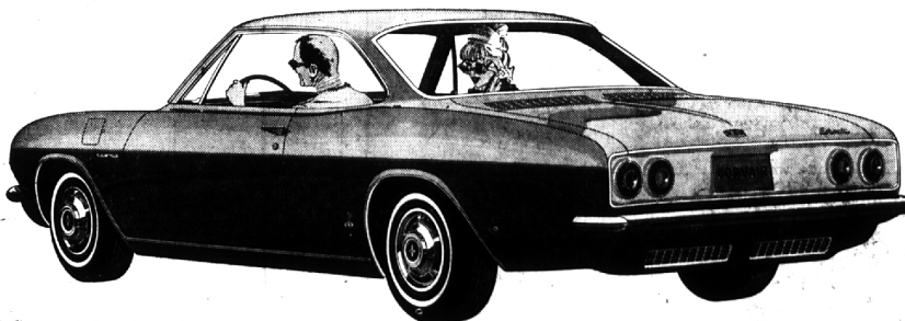
New top-of-the-line Corvair Corsa Sport Coupe

It may very well be the expensive-est looking thrift car you've ever laid eyes on. But thrifty it is. The big difference this year being that Chevy II 's marvelous mechanical efficiency now comes decked out in a debonair new look. And to keep things in stride under the hood, there's a new range of six engines available, no less, including a new 300-hp V8. Of course, you still get those famous Chevy II maintenance reducers—like self-adjusting brakes, long-lived exhaust system, battery-saving Delco-tron generator. But if you go by all the fine new features, you could get the idea that saving you money was about the last thing we had in mind when we built this one. And in a way it was. Right up until we pasted the price sticker on the window.