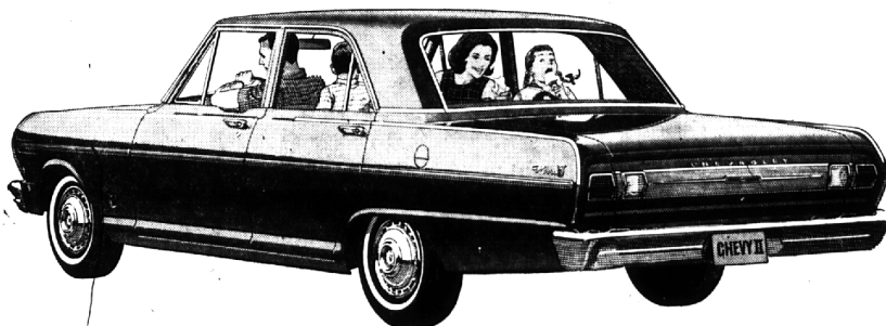
'65 Chevy II Nova 4-Door Sedan

New style, new ride—and plenty of V8 stuff. Here are all the things that have made Chevelle America's most popular new-sized car—plus some new surprises that promise to make it come on stronger than ever for '65. Like those cleaner, bolder lines. Like the silky way it skims over the choppiest roads. (Thanks to softer coil springs and other suspension system refinements, Chevelle now rides with a serenity you'd expect only in a bigger, heavier car.) Like V8 power that'll make you think we stole some of Corvette 's stuff—which we did. All told, five different power plants are now available from a quieter six to a V8 that comes on with 300 horses strong. Some people might have expected us to stand pat after introducing a car this successful last year. One short drive will show you how wrong they were.