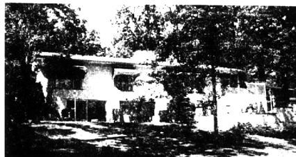
ON THE LAKE

This Monterey Colonial is in a most convenient location . . . Close to shops, schools and transportation. You'll never have to have a chauffeur's cap here. The well-kept home has four bedrooms, two baths and powder room, den AND family room.