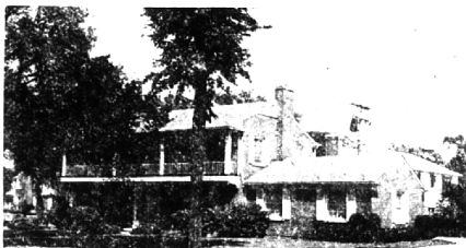
BLOOMFIELD IN VILLAGE