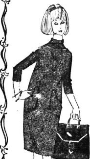
FIGURE FLATTERY FOR Mother-to-be

... Jumper Dress Tailored in beautiful Nobby Nylon blend, smart, black back trim, in sizes 8 to 16. $12.98