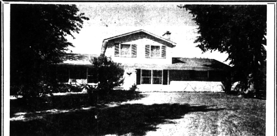
245 Harrow Circle

Early American living is expressed throughout this lovely 4 Bedroom family home. The center entrance affords the perfect family living—