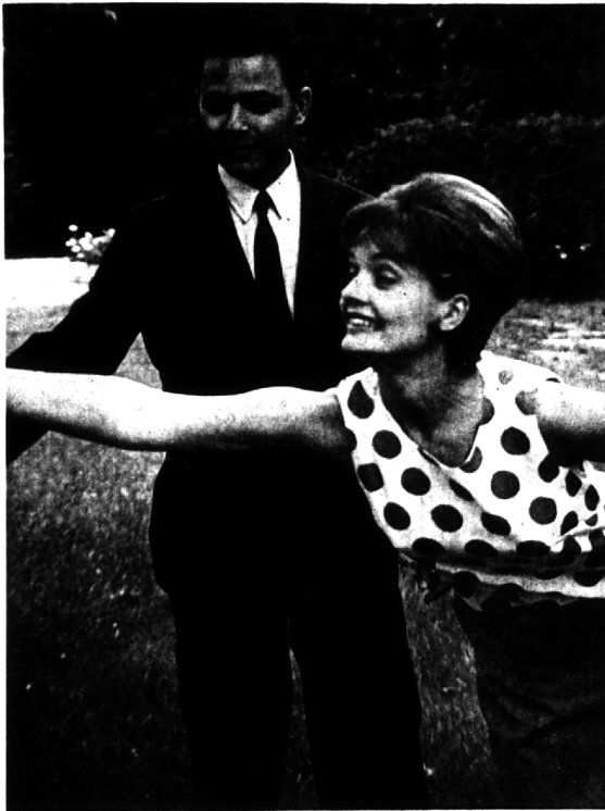
BROADWAY ON VACATION