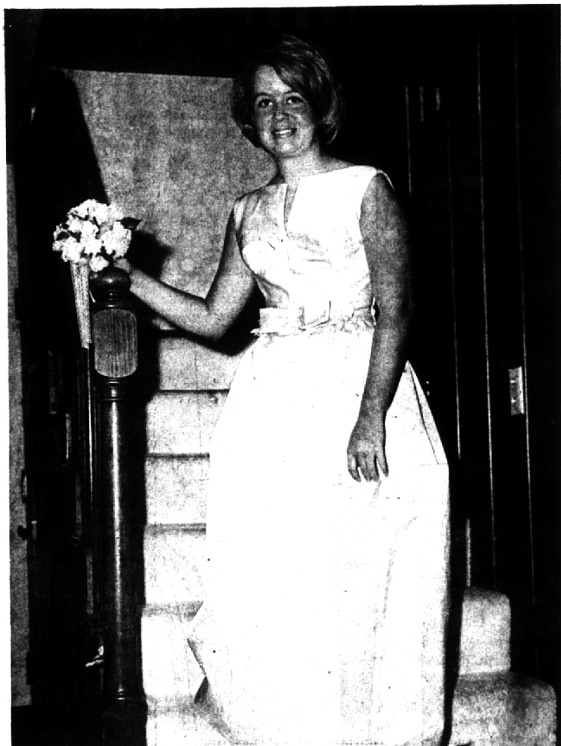
PRESENTED BY GRANDMOTHER