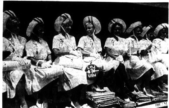
THE JOHNSON GIRLS Pulchritude campaigns for the boss on the Atlantic City boardwalk.