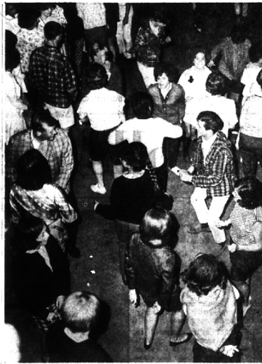
ALSA LEADERS DOING 'THE MONKEY' Soon 400 teens will be knocking on doors in this area.