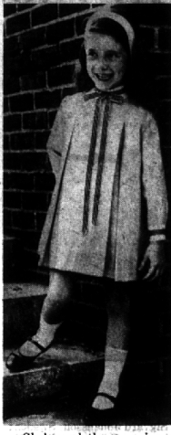
She's a clothes-conscious little girl in an A-line dress of twill-weave fabric with inverted pleats both front and back.