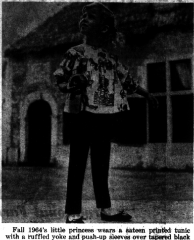
Fall 1964's little princess wears a saten printed tunic with a ruffled yoke and push-up sleeves over tapered black corduroy slacks. This pert young miss was photographed in the Belgian Village at the World's Fair.

August 27, 1964 THE BIRMINGHAM (MICH.) ECENTRIC 3-F