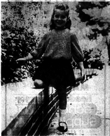
Blouson fashions are prime favorites for little people this fall. In this beguiling outfit the top, its small navy and white checks, is paired with a navy sleeveless dress with all around pleats.