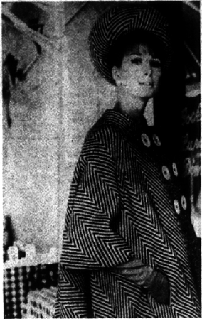
Swing around the world in a flare of taupe and beige zig zag tweed (far left) or sit by the fire in brocade pajamas with flare in the bottoms of the molded trouser legs (left). By Betty Carol.