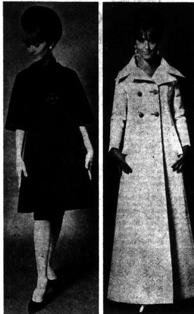
In deep purple wool