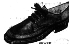
SHARK Boys 8 1/2 to 12, 8.98 12 1/2 to 4, 9.98

2 Hours Free Parking. Have Your Ticket Validated When You Make a Purchase at Jacobson's