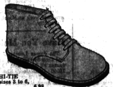
HI-TIE sizes 8 to 6, 6.98 6 1/2 to 8, 7.98