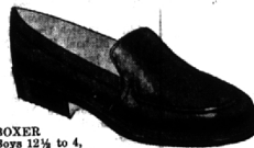
BOXER Boys 12 1/2 to 4, 9.98