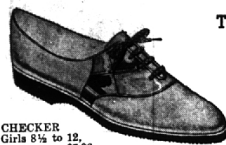
CHECKER Girls 8 1/2 to 12, $7.98 12 1/2 to 4, 8.98

Our new scientifically designed Number 26 Shoes offer a great advancement in better fitting children's shoes. They fit the foot as it moves, as it changes shape . . . protect each of the 26 moving bones in the growing foot. They are measured according to the child's height, weight and posture as well as size of foot. They grip the heel, guide the weight, hug the ankle. Number 26 shoes are correct, not corrective. Bring your children into our Children's Shoe Shop and have them fitted by specially trained Number 26 Shoe Consultant. Sizes for boys and girls, infancy through childhood.