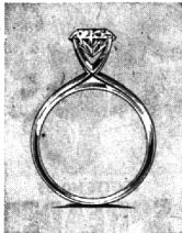
THE NEW "LYRIC" DIAMOND-OF-HER-DREAMS

Reflecting the young viewpoint, this unusual diamond ring by Orange Blossom is one of many new trend-setting designs now at Wright Kay. Consult our qualified diamond specialists.