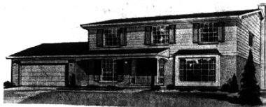
MODELS LOCATED ON OPDYKE ROAD WEST OF SQUARE LAKE ROAD