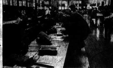
REGISTRATION IN WATERMAN GYM

U-M Orientation Anyone who has ever attended a large university should enjoy a twinge of nostalgia at seeing these pictures from Ann Arbor. Full orientation at the University of Michigan — a program that's in progress all summer long — starts Aug. 27 through Sept. 29. It's geared to ALL new students, not just freshmen, helping them become acquainted with the campus, its facilities, student life and all that is expected of them at the University. Following a large mass meeting, students are broken down into small workable groups under an orientation leader (usually an undergraduate student), after which they're ready to face the registration at Waterman Gym. A special program is planned for the parents who accompany new students to campus, this program held at the Michigan Union. The expected enrollment for the main campus in Ann Arbor this fall is 28,500. The number exceeds 30,000 if the Dearborn and Flint campuses and various extension centers are considered. During the course of orientation, women live in Allen-Rumsey House and the men live in Wexley House of West Quadrangle. It is suggested students bring the following items: Towel, wash cloth and soap, raincoat, comfortable walking shoes and a ball-point pen. A special program is planned for the parents who accompany new students to campus, this program held at the Michigan Union.