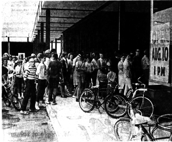
CROWDS AWAITED OPENING OF NEW KROGER STORE First business in Commons Shopping Center.