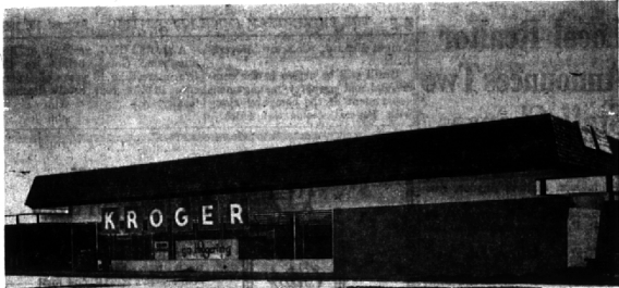
ONE OF BLOOMFIELD TOWNSHIP'S NEWEST BUSINESSES Located at Maple and Lahser Roads