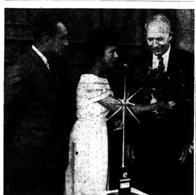
MRS. GEORGE ROMNEY UNVEILS WORLD OPEN TROPHY