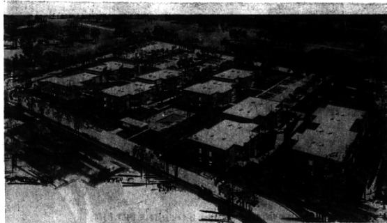
MULTIPLE HOUSING GROWS IN TOWNSHIP Advantages of individual home, minus owner's worries.

including the first natural gas-powered central air conditioning system in this area. Each of the one or two-bedroom units has either a private balcony or patio, giving the tenant an outdoor living concept not normally found in multiple housing. The OUTDOOR living concept is completed by a swimming pool nestled at the bottom of the southern slope. Marilyn Cochran, resident manager, said the rentals range from $196 for a one-bedroom to $325 for the largest two-bedroom units. While some of the units are completed and presently leased, the developers indicated that the project will not be fully completed till Oct. 1.