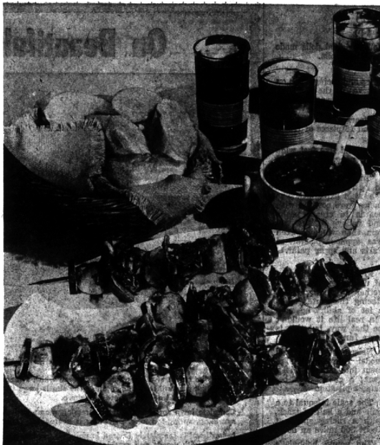
ALTERNATE PORK, PEPPER, ONIONS, ZUCCHINI FOR KEBAB DINNER Marinade and barbecue sauce is used before, during broiling.

PLACE MEAT IN MARINADE SAUCE. Let stand one hour. Drain, reserving marinade. Alternately place green pepper, zucchini, meat and onion on four long (about 12 inches) skewers. Repeat two more times until skewers are filled. Sprinkle with salt. Place on a rack in a broiling pan. Measure 1/2 cup marinade, set aside, and keep warm. Liberally brush kebabs with half of the remaining marinade. Place kebabs four to five inches from heat and broil 20 minutes, turning and brushing with remaining unmeasured marinade after 10 minutes. Serve kebabs with 1/2 cup warm marinade. Makes four servings.