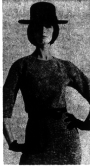
THE TWEEDED BLOUSON A-skirted and belted with leather.

A most important garment for this coming fall — the simply styled wool dress for the days that are too warm for a suit but with a slight bite in the air. These dresses are precisely