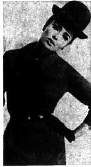
STEP-IN SHEATH Buttoned, belted and bowed.