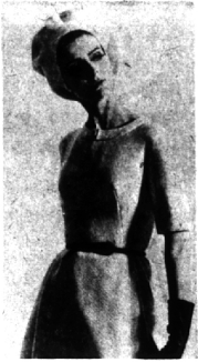
BEAUTIFULLY CASUAL Panel pleated, deep softness.