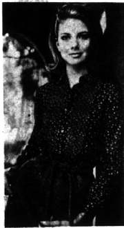
BOUQUET OF STYLE Miniature flowers on panel tucked shirt

The blouse with a print is the headline maker in fashion news today. Patterns range from tiny concise calico florals to splashy neat stripes. An important fea-