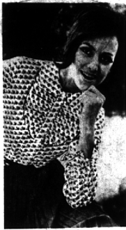
'FAN FRILLED' Enhanced with ruffled sleeves.