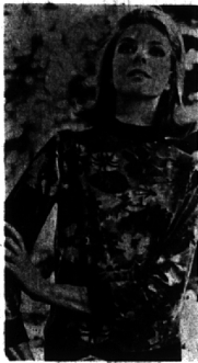
BRIGHT TURTLENECK In washable jersey.