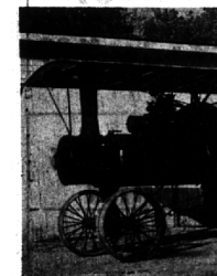
INSTITUTION IN BIRMINGHAM Progress drives thresher out of town.