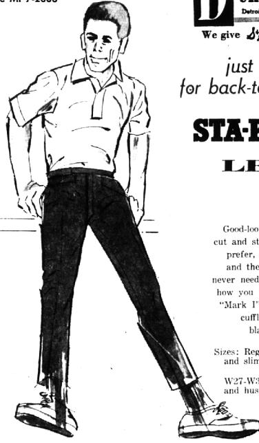
Boy's Clothing—Main Level

Open 9:30 till 6 (Thurs., Fri, till 9) Phone MI 7-2000