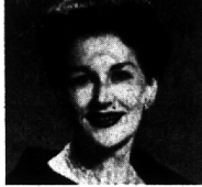
Heads Area Group