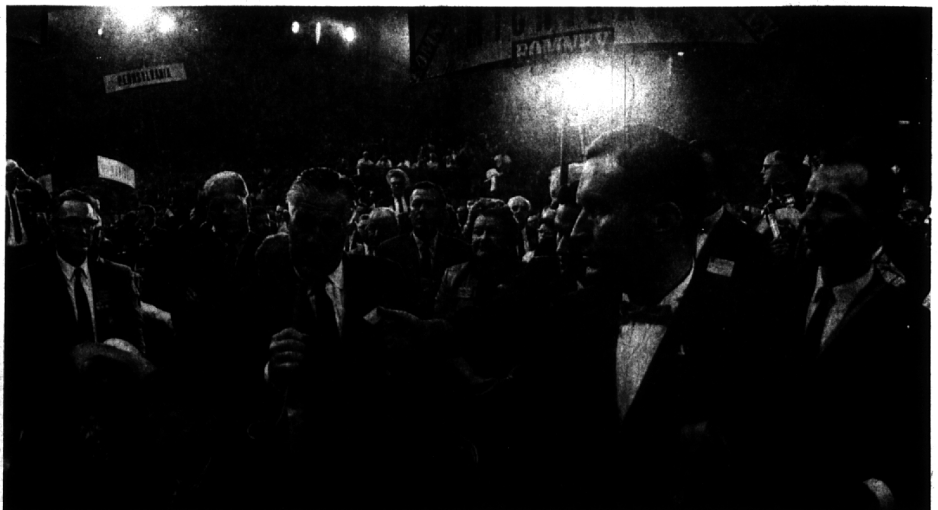
GOV. ROMNEY SECONDS MOTION TO MAKE GOLDWATER NOMINATION UNANIMOUS To the left and behind the governor is Rep. Gerald Ford of Grand Rapids.