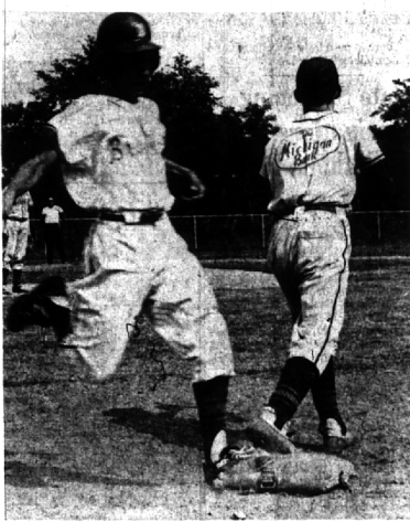
BRONCO RUNNER HITS FIRST AHEAD OF THROW Pony team rolled to a 7-1 win over Wildcats.