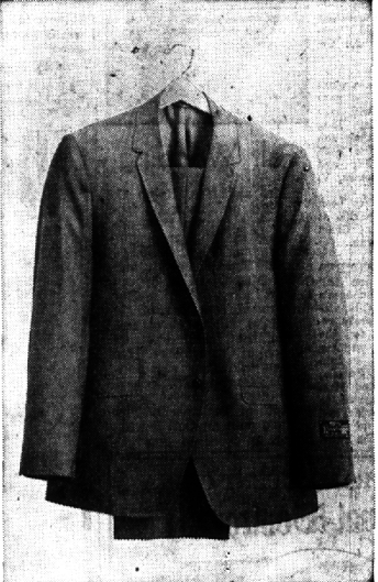
This exceptional tropical Dacron/Worsted Suit by Martinelli Sale priced $44

Alas, the price tag on the home remains a dream. But we can make you feel at home in the suit for a mere $44. And "mere" is the word, when you consider the superb Martinelli needlework. Also consider: The breeze-catching Dacron & worsted fabric on those scorchy days. (Ahhh... what a pleasure!) And how it shrugs off wrinkles. And those handsome 2- and 3-button models, in neat plaids, solid shades or the new iridescents. All considered, why not come in and try one on? (You'd be surprised how many Birmingham-Bloomfield men wouldn't dream of going anywhere else.)