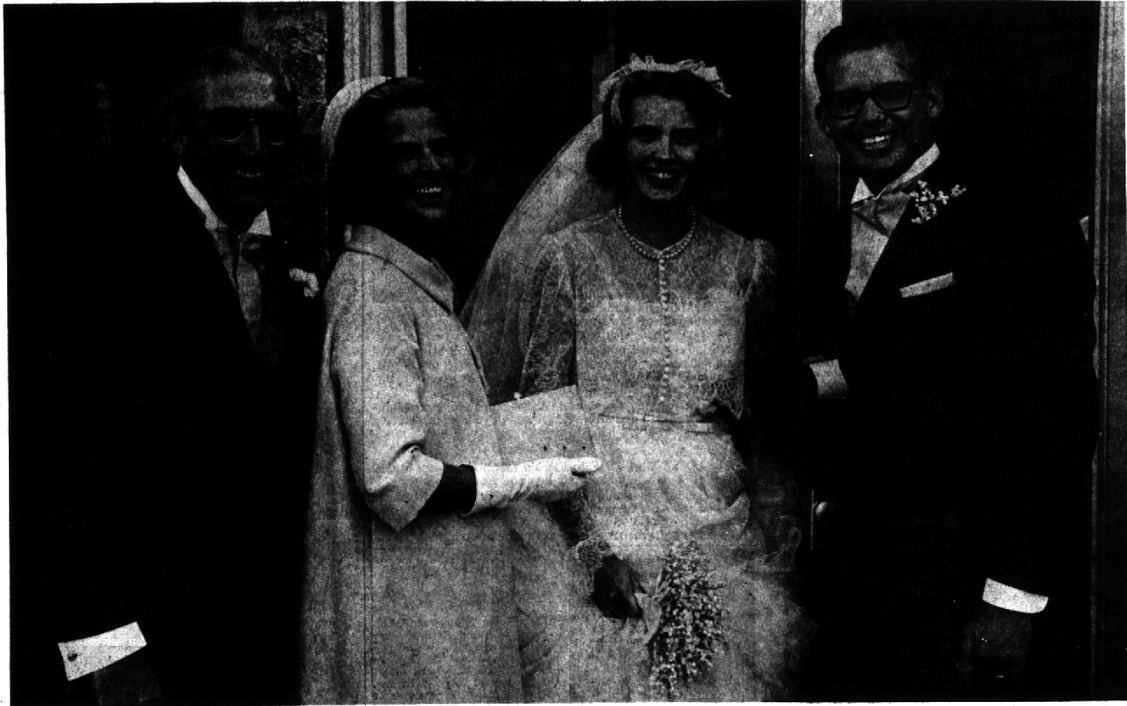
... "and immediately following the ceremony, a reception was held at home" ...