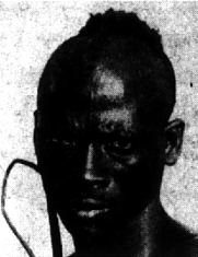
MASSA NATIVE Africa on exhibit