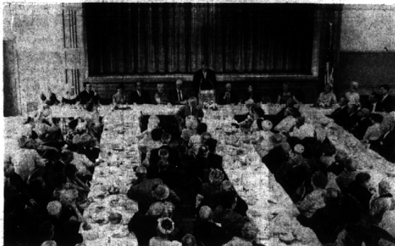
NEARLY 250 people attended the Heritage Day luncheon Friday at the Community House, where Birmingham's oldest citizens and its youth were honored. Standing at the podium here is Mayor Charles W. Renfrew.

In April, 1966, two councilmen would be elected to serve until November, 1968, while another councilman would serve until November, 1970.