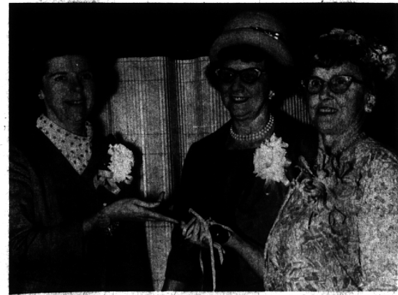
Annual Luncheon Is Held