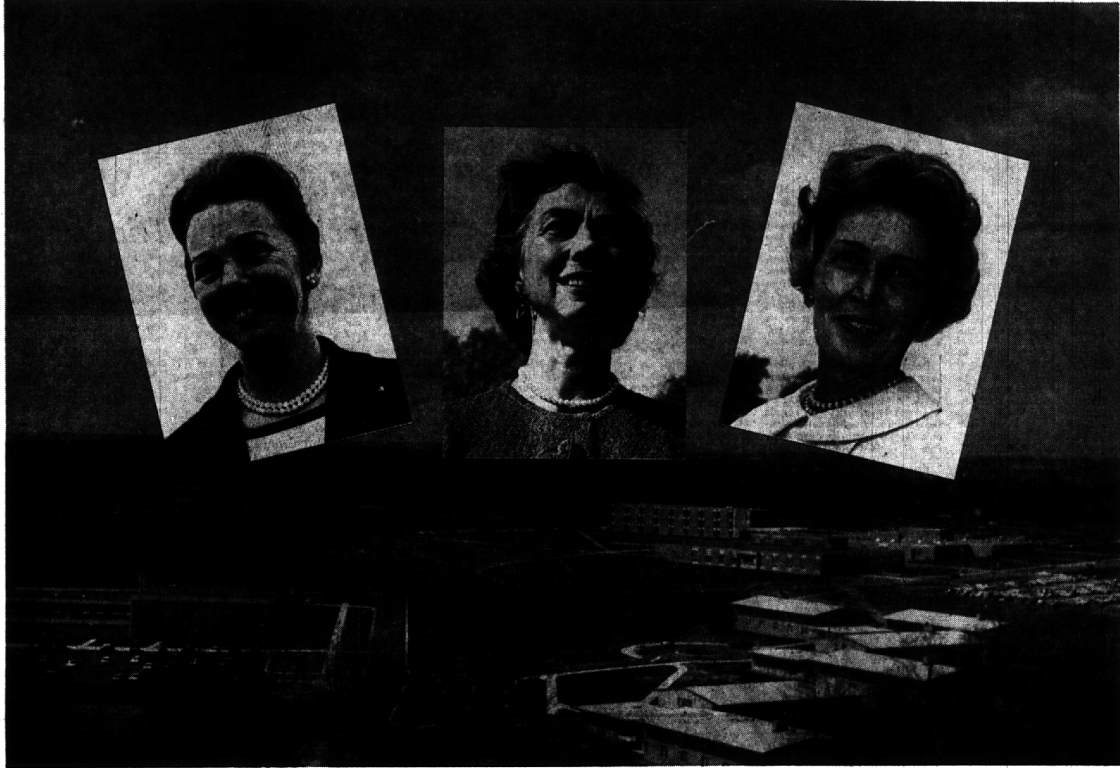
Meadow Brook Ball Spells Oakland