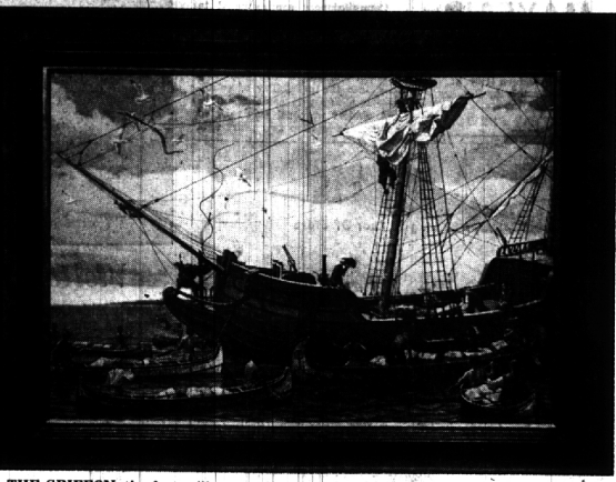
THE GRIFFON, the first sailing vessel on the upper Great Lakes, is visiting St. Ignace in this painting. The Griffon, a legendary monster half lion and half eagle, was carved on the ship's prow. The vessel disappeared in 1679 on the return of her maiden voyage, with no trace ever found.