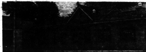
Remember Pennell's Doughnut Shop on South Woodward? (First Established 1947)

PENNELL'S . . . AN OLD NAME IN THE FOOD BUSINESS IN BIRMINGHAM