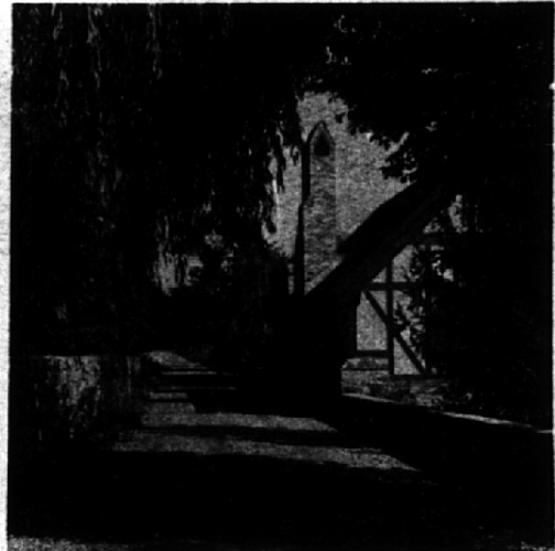
THE MEETING HOUSE—BUILT IN 1916 Building housed Christ Church in mission days.