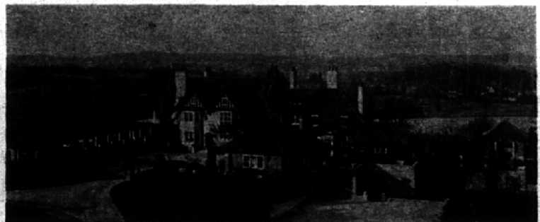
CRANBROOK HOUSE WAS COMPLETED IN 1908 Its statuary, water falls and walks draw thousands.

West Bloomfield Township was known as the "lake township" of Oakland County at the turn of the century. See story, page 15.