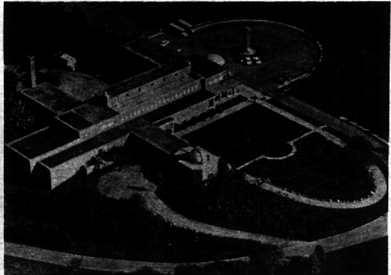
AERIAL VIEW OF CRANBROOK INSTITUTE OF SCIENCE An ever-popular attraction for visitors.