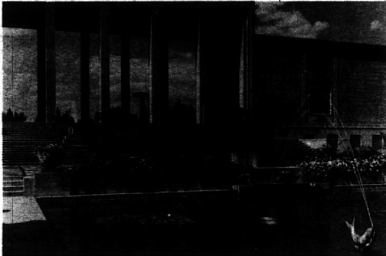
PERISTYLE AT TRITON POOL AND WATER GARDENS It has often been called the "landmark of Cranbrook."