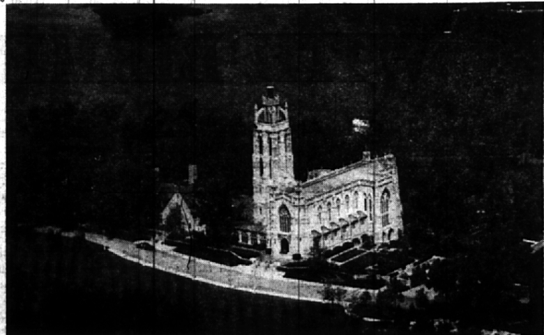
KIRK IN THE HILLS PRESBYTERIAN CHURCH