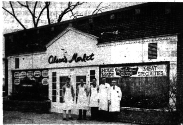
OLSEN'S MARKET 1964