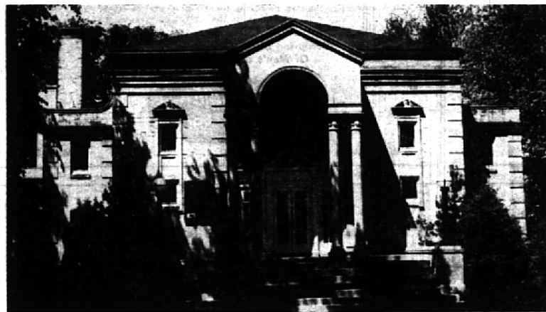
FIRST CHURCH OF CHRIST SCIENTIST BEFORE REMODELING IN 1961 In 1916 adults met in homes, while kids gathered in a garage.