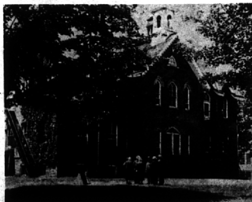
HILL SCHOOL AT CHESTER AND MARTIN It began serving the village in 1869.