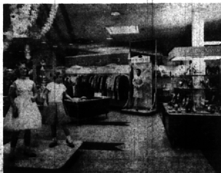
Section of Second Level Girls' Shop