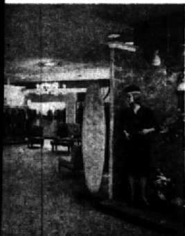
Shop, Second Level