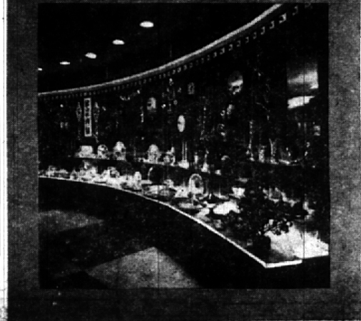
Gift Shop, Lower Level