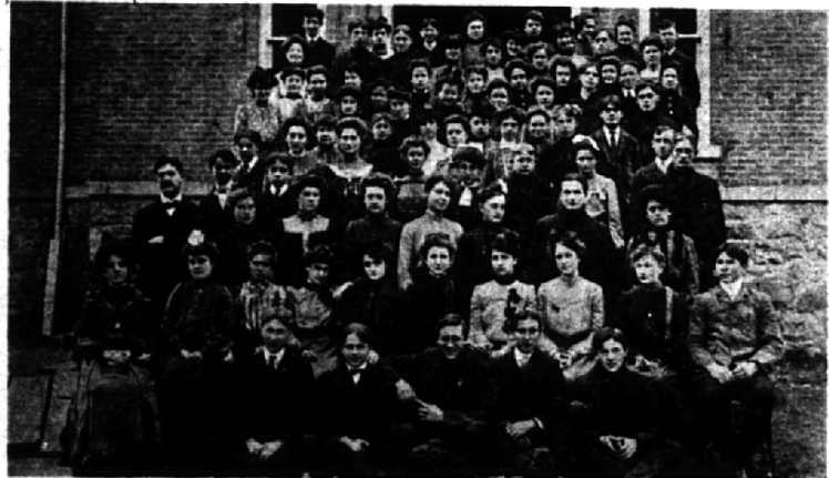
THE 1903 HIGH SCHOOL CLASS NUMBERED 75 Three teachers instructed all on the second floor.