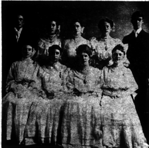
HILL GRADUATING CLASS OF 1905 All nine bedecked in their Sunday best.