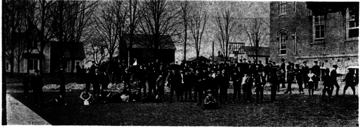
BIG MEN ON CAMPUS AT HILL SCHOOL DURING THE FALL OF 1903 A time when pupils and parents had problems and a woman's work was never done.