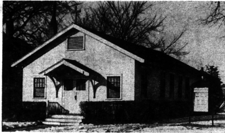
FIRST BUILDING AT THE CORNER OF LINCOLN AND ANN STREET.