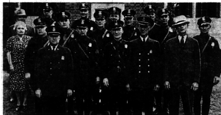
GUARDIANS OF THE CITY IN 1929 They kept law and order in a fast growing community.