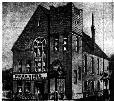
LADIES' LIBRARY HALL IN 1893 Property cost $1,500, building itself $4,500.