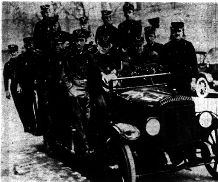
STALWART GROUP OF VOLUNTEER FIREMEN They all came running at first clang of the bell.