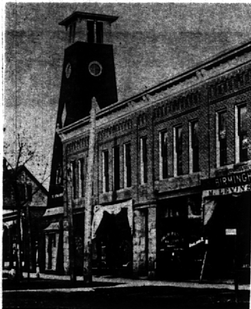
PICTURESQUE OLD FIRE HOSE TOWER Located on W. Maple, it served as storage place.