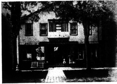
1910 Only available photo showing the Daines & Bell Funeral Home.