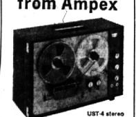
UST-4 stereo tape recorder

$299.00 complete (for a limited time only) from Ampex