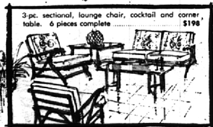
3-pc. sectional, lounge chair, cocktail and corner table. 6 pieces complete . . . . . $198