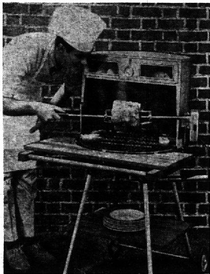
When "dad" gets inspired to do the cooking, let him! Taking the muss and fuss out of the kitchen is a boon to any housewife and if his nibs is provided with a new 24-inch motorized brazier by Structo, featuring work shelf, towel bar and utility shelf, he'll be glad to oblige any night of the week.

One interesting development in outdoor seating is the lounge cushion. These pillows are made of large, thick latex foam rubber cores covered in vinyl, sailcloth, or other sturdy fabric, and are intended to be scattered at random on the floor or ground. They were adapted from the popular throw pillows used for the same purpose indoors.