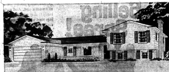
The Kingswood • Tri-level • 3 Bedrooms • 2 1/2 Baths • Living Room • Separate Dining Room • Kitchen with Breakfast Nook • Family room with natural fireplace • Sliding glass door-wall leading to sunken patio • Hobby Room • 2 1/2 Car garage with raised storage area. Priced from $26,950

HOMES PRICED FROM $26,950 including basic lot FREE MEMBERSHIP IN YEAR 'ROUND SWIMMING POOL LOCATED IN BLOOMFIELD BLOOMFIELD HILLS SCHOOLS Detroit Water and Sewer, Underground Wiring, Paved Streets